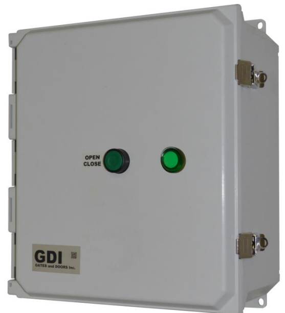
NEMA 4/4X Control Panel