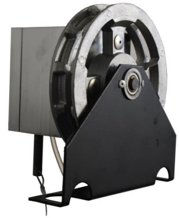
Axial chain hoist add on

GDI reserves the right to modify the contents without prior notification.