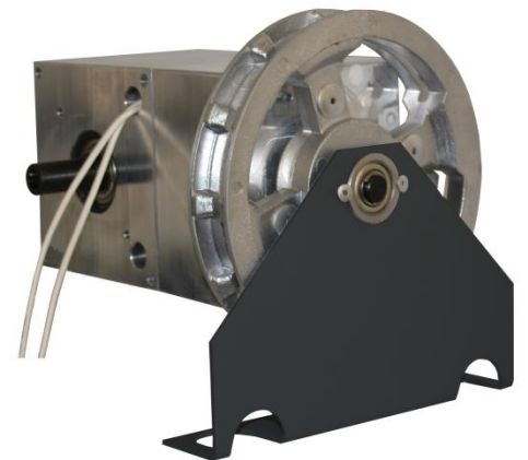
Right angle chain hoist add on